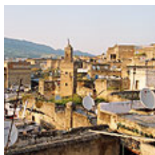
Marrakech, Morocco